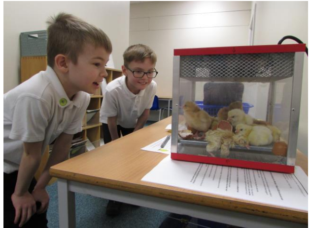
Awe and Wonder