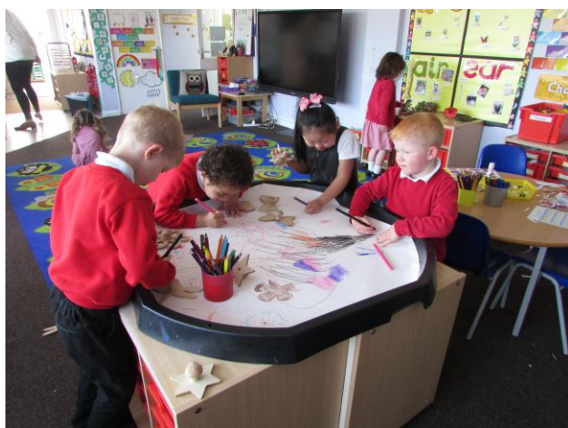
Developing our Fine Motor Skills

Children are prepared to reach the Early Learning Goals at the end of the Foundation Stage and we ensure all children make good progress from their varied starting points. This supports their transition into Year 1 and their readiness to build upon their learning. We aim to ensure all children have the confidence and skills to make decisions and self-evaluate, make connections and become lifelong learners.