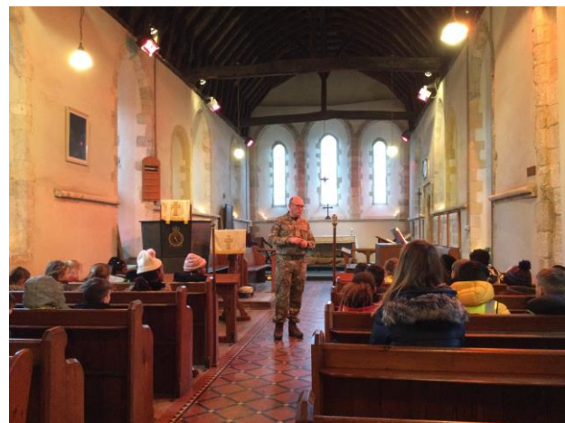
Visit to St Nicholas Church on Thorney Island