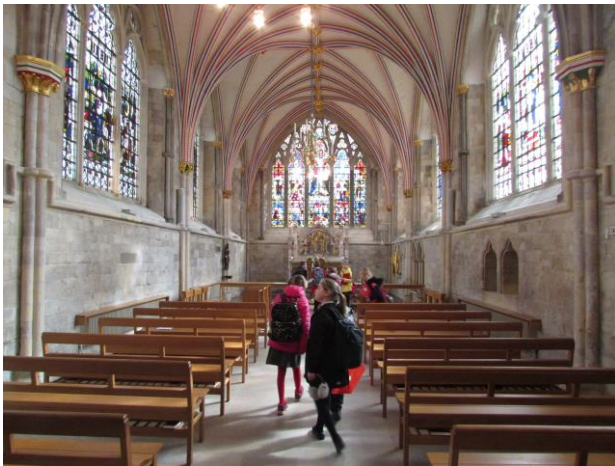
Visit to Chichester Cathedral

The personal development of pupils and the establishment of healthy attitudes of mind are important features of the primary years, and the aim of the school is to foster caring relationships between the adults and the children, and among the children themselves. The aims of Religious Education and the Programme of Study are those set out in the West Sussex Agreed Syllabus for Religious Education. School Assemblies and Religious Education lessons provide excellent opportunities to think together about worthwhile values and the spiritual and cultural heritage within which the children are growing up. They help to develop in the children a sense of personal responsibility, an understanding of others and a positive attitude towards playing a full part in the life of the school community. If parents wish to withdraw their child from Religious Education they should contact the Headteacher.