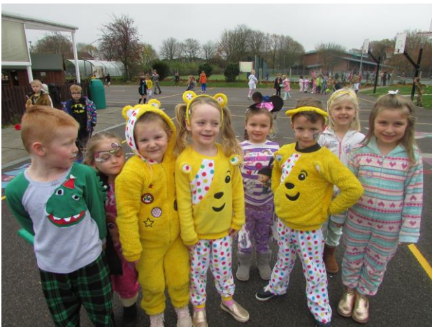
Children in Need