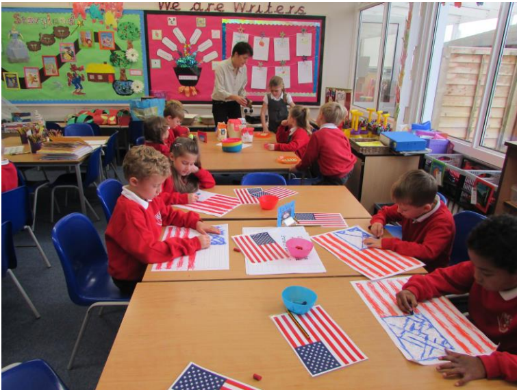
International Week Where children meet people from all over the world.