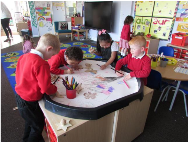
Developing our Fine Motor Skills

Before children come into school it is our aim for them to meet their new teacher in their pre school setting and they will be invited into school for a taster session. Parents too, will be given opportunities to meet the Early Years Foundation Stage Teacher, the class Teaching Assistant as well as the Headteacher and other key people they may come into contact with at school. We find that children are then happy to come into school and the transition process is a smooth and positive experience for all.