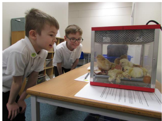
Awe and Wonder